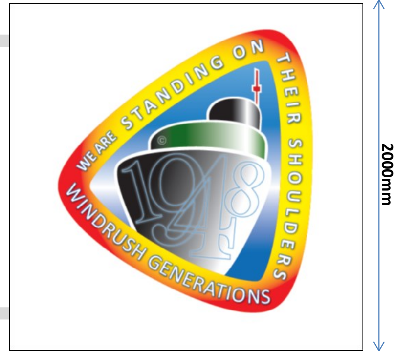
Flag shown left hand side of pole

Flag fabrication will be double sided knitted polyester with blackout silver interliner , hemmed rope & toggle