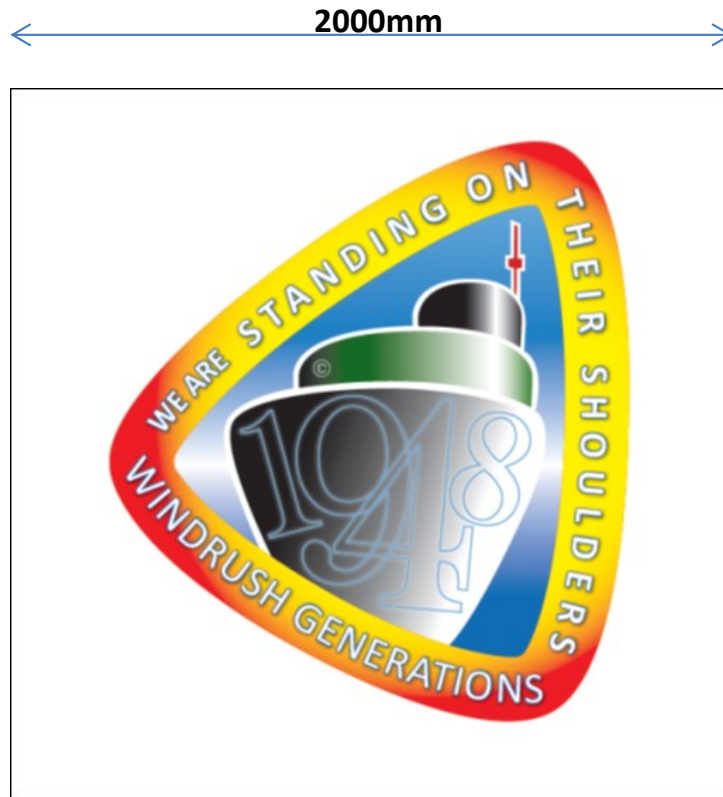
Flag shown left hand side of pole