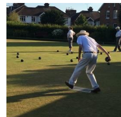
Figure 3: The Mayor enjoying Bowls

Many Mayoral events within the year are also promoted internally within the Council, by the Mayor's Office, which reinforces the union between Officers and Councillors. The Civic Office also plans, manages and provides staff support to the Annual Mayor's Bowls Match, drawing together Councillors, Officers and key members of the community for a charity bowls match, allowing all to mix and understand each other in an informal and fun environment.