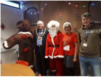
Figure 2: The Mayor with Best Dressed Office Winners

Within Tunbridge Wells, we want the Council Officers to feel that the Mayor is approachable and not a 'force to be reckoned with'. We organise a series of events for the Officers, including a 'Best Dressed