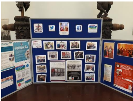
Figure 9: The Mayor's Noticeboard outside the Council Chamber

The Mayoral Noticeboard is constantly updated and highlights and showcases many events to come