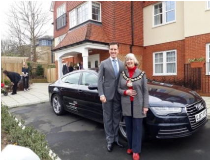
Figure 11: Mayor of 2017-2018 with Anton Du Beke with the Mayoral Car

A great example of using sponsorship whilst saving money has been the Mayoral Car. The recent departure of a full time driver and attendant has thrown doubt on the future of having a car at all; and whilst this is still under scrutiny, the Mayor's Office has managed, in the short term, to keep this tradition through the use of casual drivers and a continuation of a sponsorship deal with the local Audi garage. Managing the use, maintenance and day to day running of this car and the casual drivers to be aligned with the needs of the Mayor falls to the Mayoral team. This involves a significant amount of time spent managing a very tight budget to run and