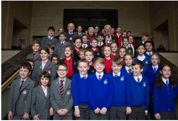
Figure 5: Our Fly the Flag Ceremony

At Tunbridge Wells, we commemorate the Commonwealth each year with the 'Fly the Flag' ceremony. The Civic Office organises several local primary school children to come in to the Town Hall to chat with and ask the Mayor questions about the Commonwealth, what it is, its history and its importance to our country as well as its contribution to harmony and mutual understanding between Nations. Children watch the hoisting of the Commonwealth flag, and absorb the importance and grandeur of the