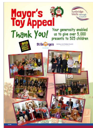
Figure 6: Thank You Poster from 2018's Mayor's Toy Appeal

Additionally, each Mayor is encouraged by the Civic Office to pick a local charity close to his or her heart, to support. This year the current Mayor chose Tunbridge Wells Mental Health Resource, and being the Mayor's chosen charity provides much more kudos and public recognition than would normally be received. This has run true with the 2017 charity, Domestic Abuse Volunteer Support Service, a domestic abuse charity which was little known before being chosen. The Civic Office always chooses local venues to host Mayoral events and promote the chosen charities. In doing so, the Office is keen to exploit any opportunity to promote the Borough as well as the Mayoralty. Every year, the Civic Office also organises the prestigious Civic Dinner and the Mayor's Charity Clay Shoot, two hugely supported events which help to bring together people, organisations and businesses from the wider area, providing a real sense of unity and community spirit across the Borough.