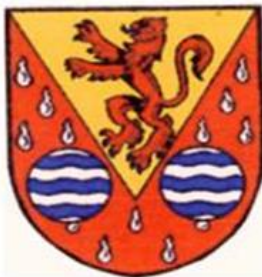
Figure 4: Tunbridge Wells Twinning & Friendship Association Crest

Since 1989, Royal Tunbridge Wells has been twinned with Wiesbaden - a town